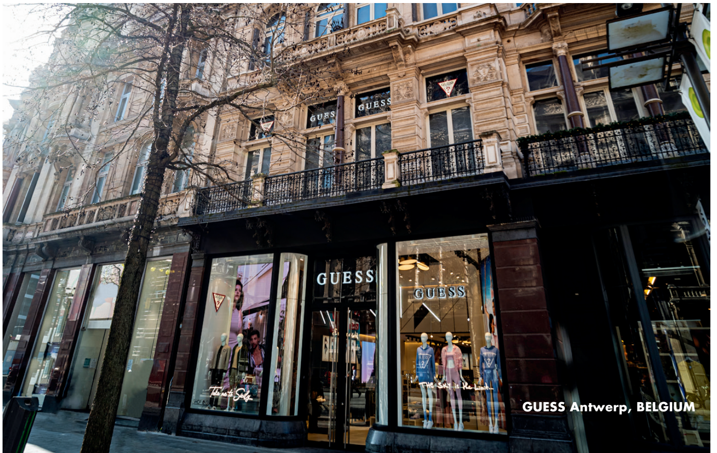
GUESS Antwerp, BELGIUM