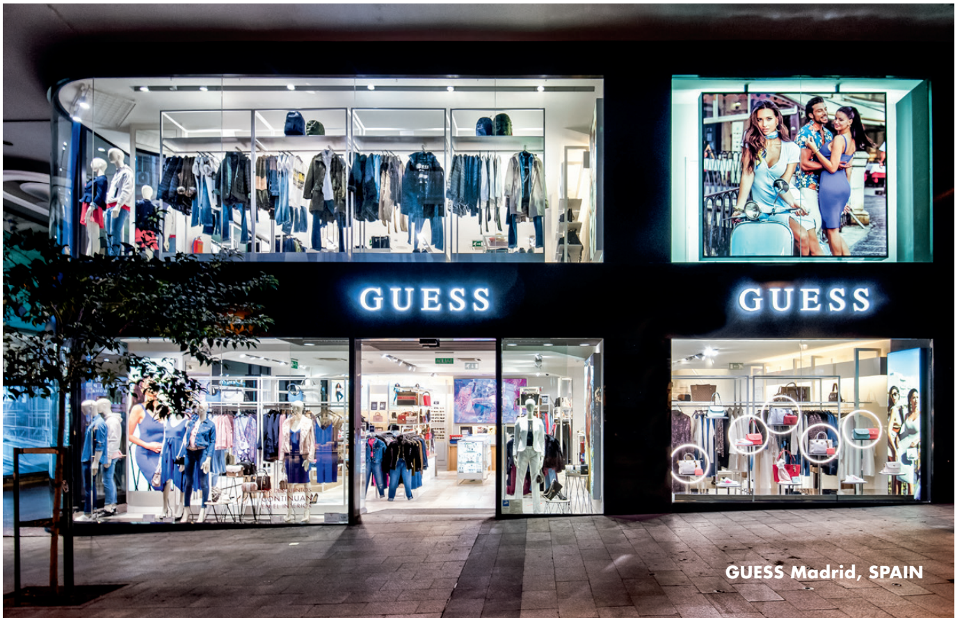
GUESS Madrid, SPAIN