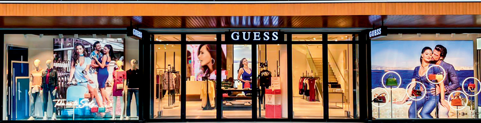
GUESS Rotterdam, HOLLAND