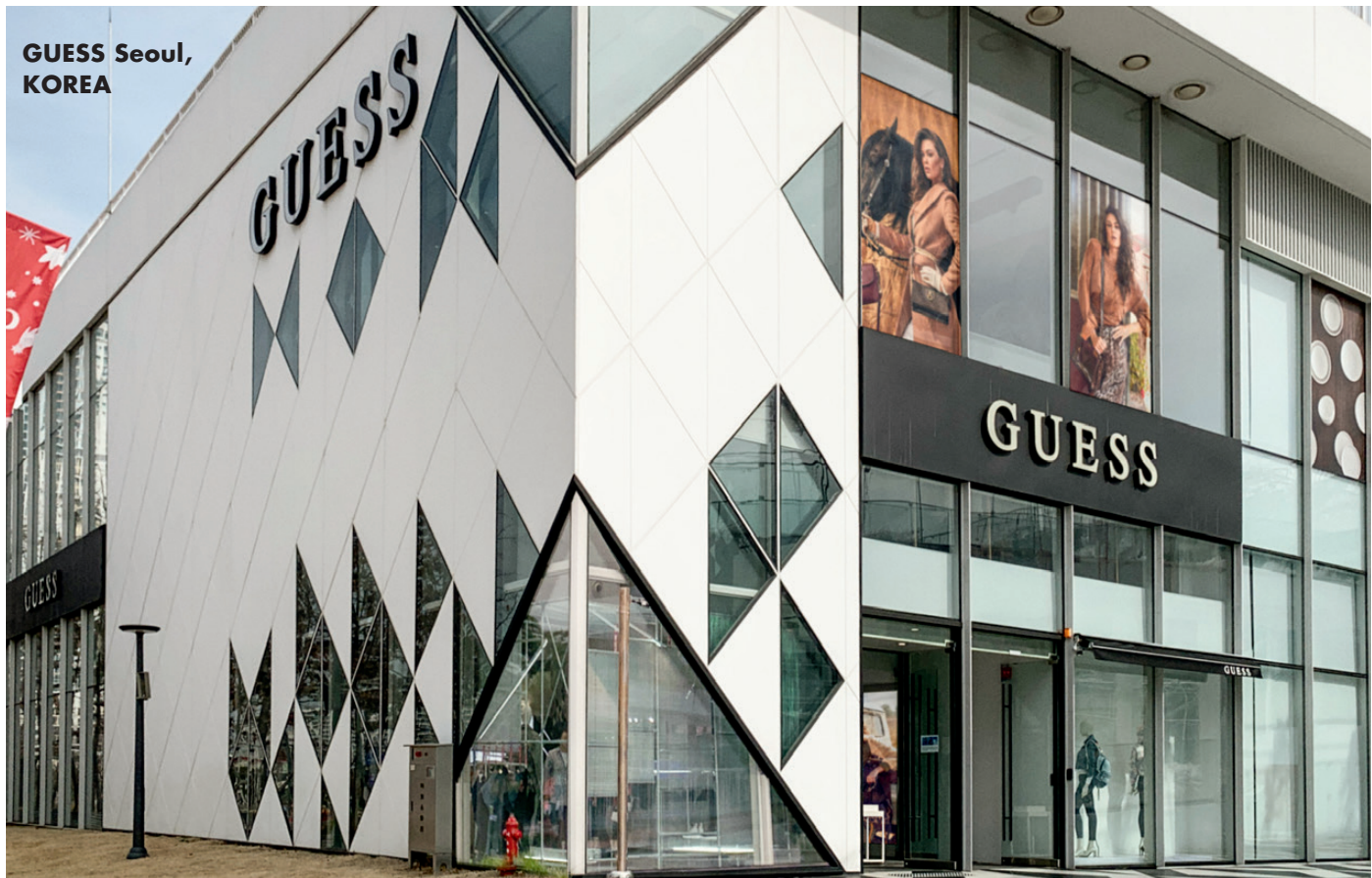
GUESS Seoul, KOREA