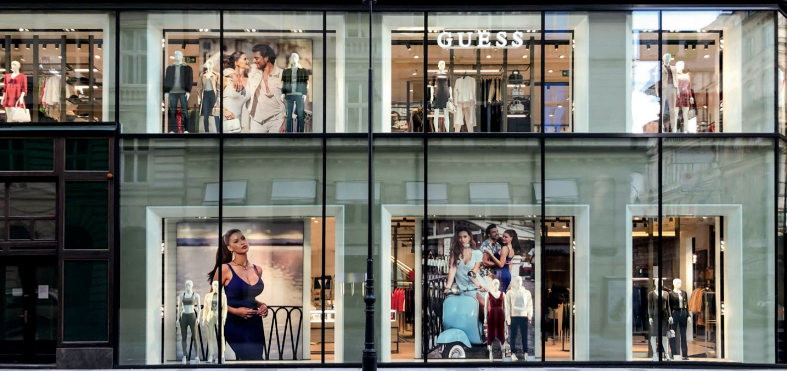
GUESS Vienna, AUSTRIA