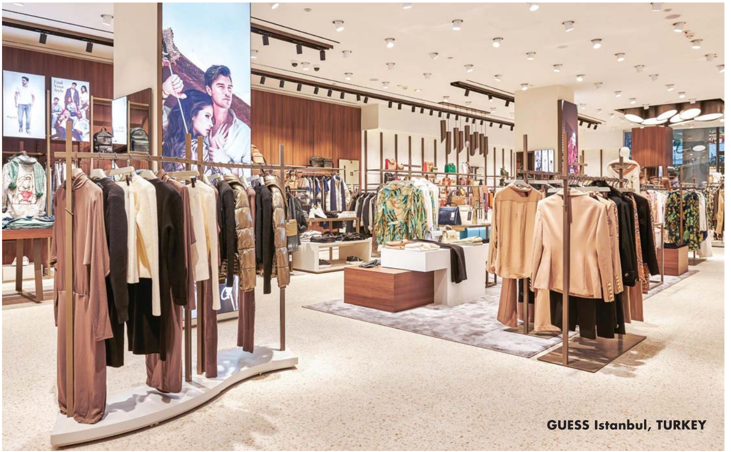
GUESS Istanbul, TURKEY