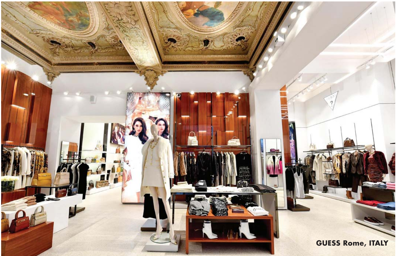
GUESS Rome, ITALY