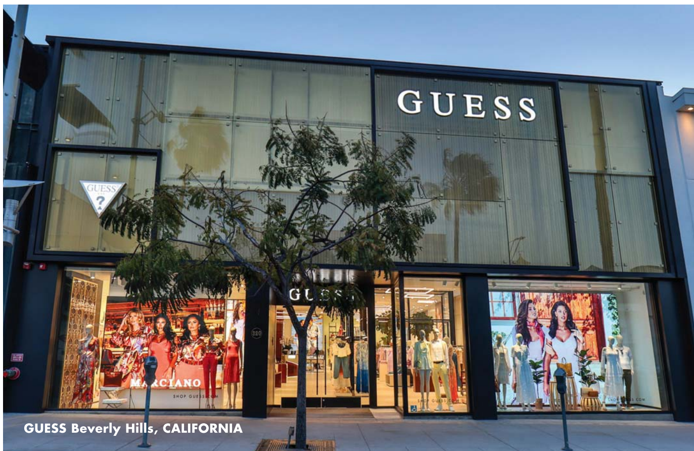
GUESS Beverly Hills, CALIFORNIA